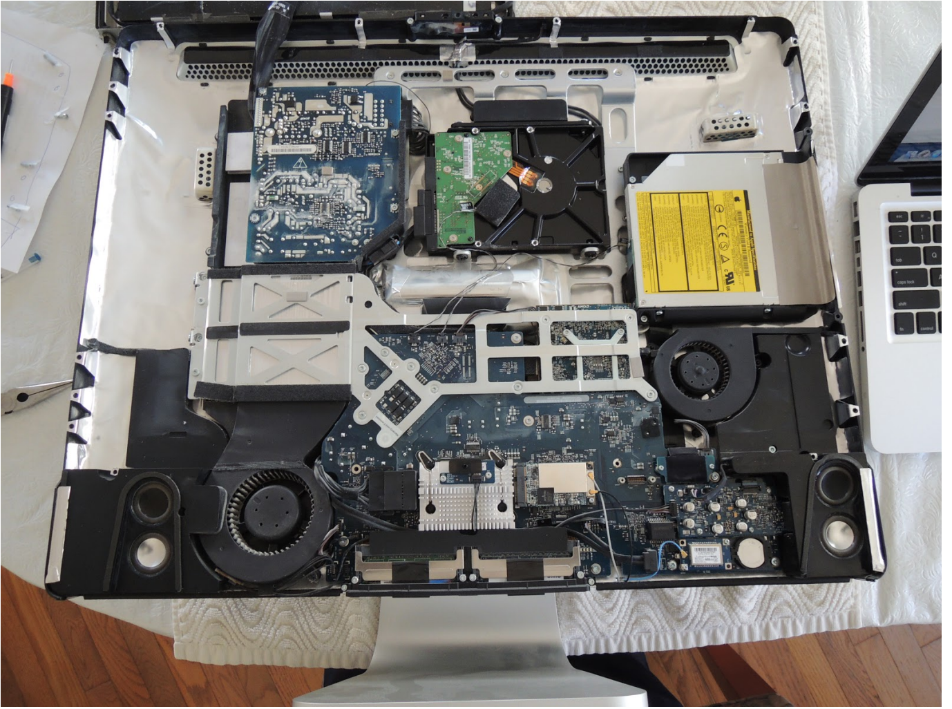
How To Install Ram In Imac 2007 Computer